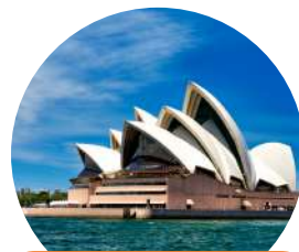
DISCOVER ILSC SYDNEY