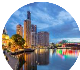
DISCOVER ILSC BRISBANE