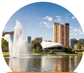
DISCOVER ILSC ADELAIDE