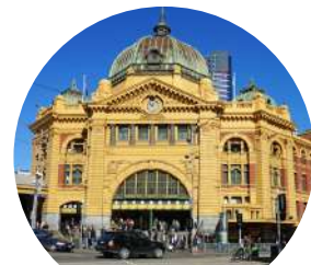
DISCOVER ILSC MELBOURNE