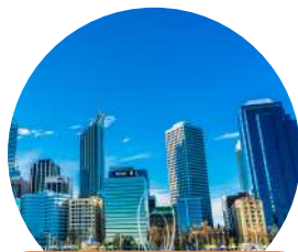
DISCOVER ILSC PERTH