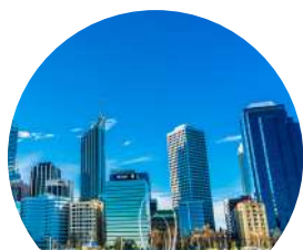
DISCOVER ILSC PERTH