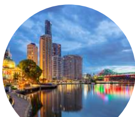
DISCOVER ILSC BRISBANE