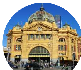
DISCOVER ILSC MELBOURNE