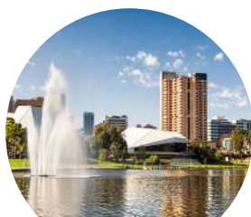
DISCOVER ILSC ADELAIDE