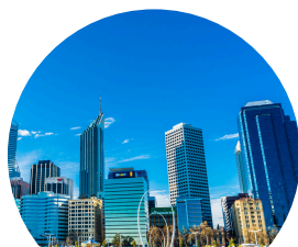
DISCOVER ILSC PERTH