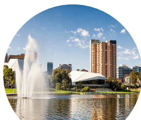
DISCOVER ILSC ADELAIDE