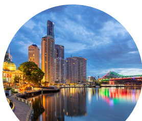
DISCOVER ILSC BRISBANE