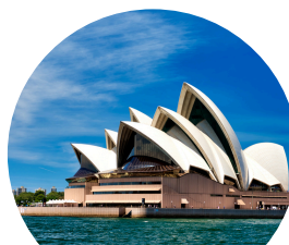
DISCOVER ILSC SYDNEY