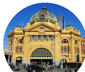
DISCOVER ILSC MELBOURNE