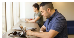
Cambridge English (FCE, CAE, CPE)